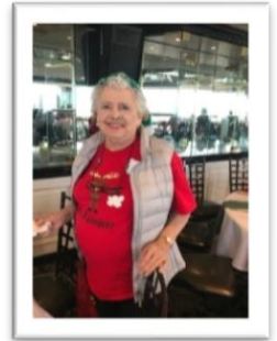
Hey, they said ugly sweater contest!

Our Holiday Luncheon was a success! Over 230 people attended the luncheon; consequently, the banquet room was overflowing. The view was beautiful. The food was delicious, and the music (including a fun singalong) added a festive touch. Celebrating with friends and "old" colleagues was a great way to start the holiday season.